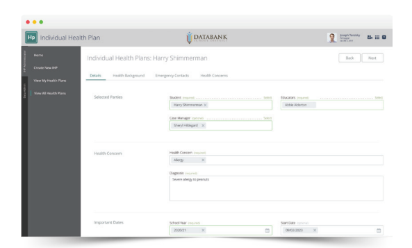
Elevate health data to students' Spotlight Dashboards, giving teachers instant access to life-saving information.