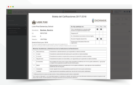
Share meaningful data with families, published in the home languages of your English-language learners.